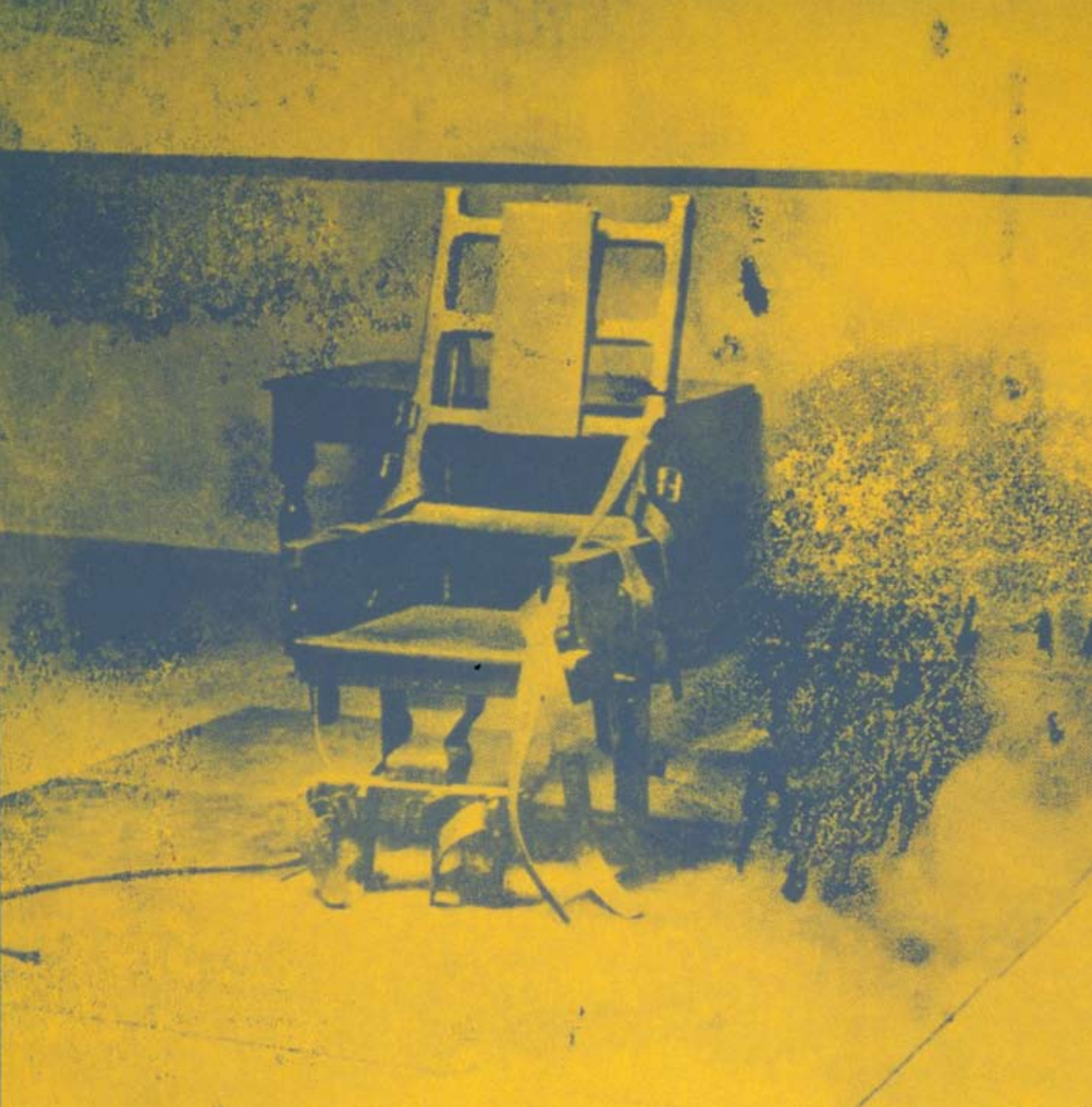
The Andy Warhol Foundation for the Visual Arts 20-Year Report 1987-2007 Grants and Exhibitions