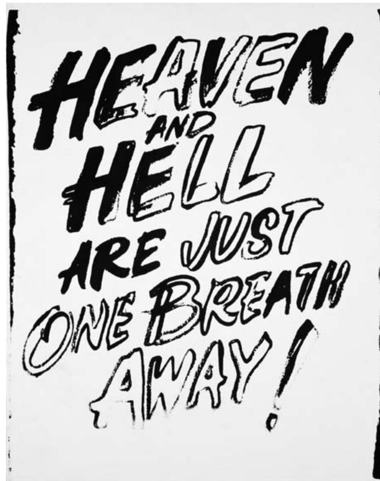
Heaven and Hell Are Just One Breath Away! , c.1985–86, Synthetic polymer paint and silkscreen ink on canvas, 20 x 16 inches

Deutsche Guggenheim Berlin, Berlin, Germany